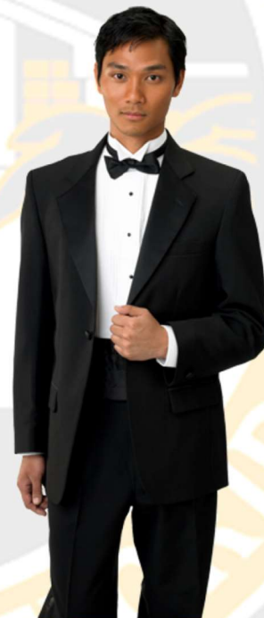
Applause Polyester 1-Button Notch Lapel Item #4500

In most cases one can find the white tux shirt, bow tie and cummerbund as a package deal at a local clothing store for about $15-20 (Burlington Coat Factory, JC Penney, etc.). You can choose to purchase your own black sport coat at any local clothing vendor or on-line. Below is an example of Demoulin Uniforms black performance sport coat. University High School does have a few tux jackets for students to borrow on an as needed basis.