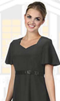
Crepe Black Satin Item #4882CS $68 plus shipping